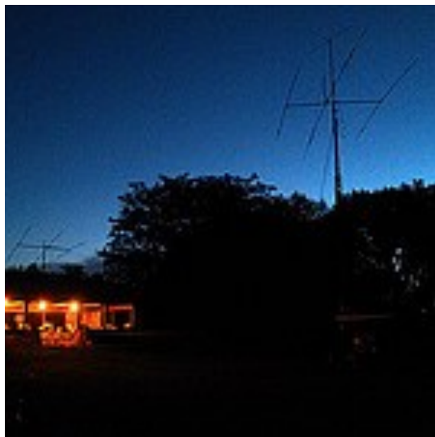
Saturday evening serenity

These preparations included a canopy for the two Honda generators and copious grounding for electrical and the towers. Of course the important issue of food was well handled with a great smoked brisket supper as well as numerous pot luck items. The numbers were up this year,