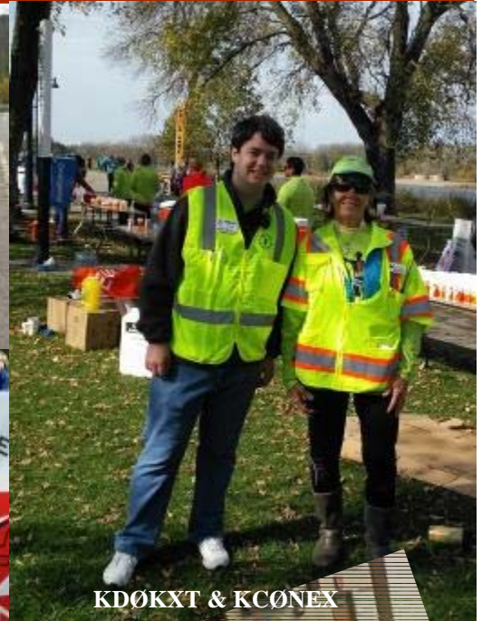
KDØKXT & KCØNEX