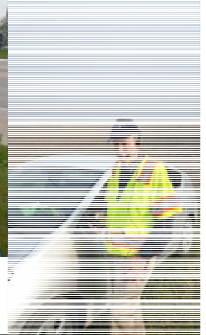
Market to Market Relay Race