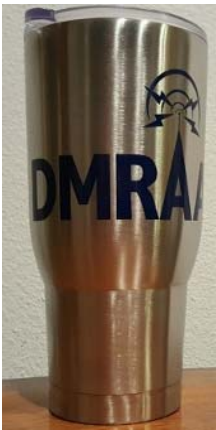
DMRAA Stainless Steel Travel Mug

We still have Limited Edition 30-ounce DMRAA Stainless Steel Travel Mugs available. These will make great gifts for anyone on your lists, and at $20.00 each, will support the DMRAA as well. Contact Scott, NØOOD