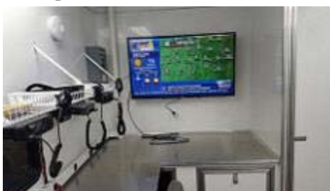
New TV mounted in EMCOM 1